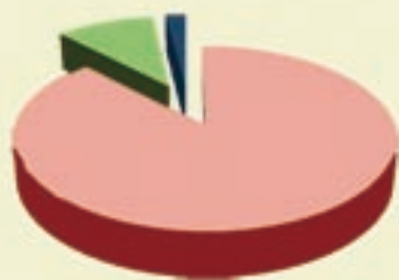
表一 Figure 1

357 宗僱傭範疇的殘疾歧視投訴— 大部分投訴與病假和工傷有關 Of the 357 employment-related DDO complaints, most of them were related to sick leave and work injuries