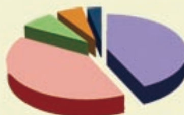
表二 Figure 2

309 宗僱傭範疇的性別歧視投訴— 大部分投訴與懷孕歧視和性騷擾有關 Of the 309 employment-related SDO cases, the majority were related to pregnancy discrimination and sexual harassment