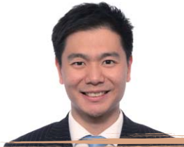
周浩鼎議員 The Hon CHOW Ho-ding, Holden