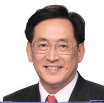
周一嶽醫生 Dr CHOW Yat-ngok, York, GBS