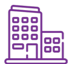
Office Buildings and Office Spaces