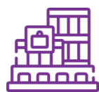
Shopping Malls and Retail Spaces

The UDAS has five Application Categories as follows: