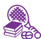
Buildings and Sites with Recreational, Sports or Cultural Purposes