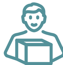
Provision of goods, services and/or facilities