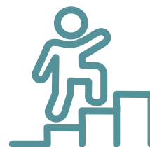
Eligibility to vote in and to stand for election to public bodies, etc.

The RDO is binding on schools. This learning kit provides schools, teachers and students with an introduction on their rights and liabilities under the RDO.