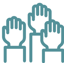
Participation in clubs