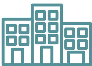
Disposal and/or management of premises