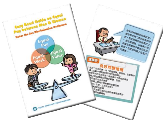
Easy Read Guide

The guidebooks consist of a main guide (Guide to Employers on Equal Pay between Men & Women Under the Sex Discrimination Ordinance) and three supplementary books entitled “An Illustration on Developing an Analytical Job Evaluation System Free of Sex Bias”, “A Systematic Approach to Pay Determination Free of Sex Bias”, and “Equal Pay Self-audit Kit - A Proactive Approach for Employers to Achieve Equal Pay”. While the guidebooks provide detailed explanation on the concepts, principles and practical tools for implementation, the Easy Read Guide presents the key concepts and principles facilitating understanding of all users including employers of small business and employees in general.