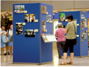
"EO Through Your Eyes" roving photo competition.

The EOC launches its annual major public education initiative - "EO Expo 2005" on 29 October 2005 at Lok Fu Shopping Centre. "Overcoming Adversity to Build a Better Future" is the theme for this year's community events, which runs from November through December 2005.