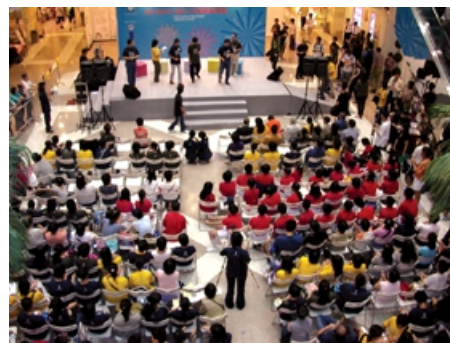
Every year, the "EO Expo" draws large groups of interested participants.