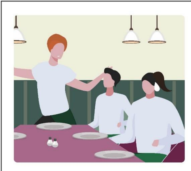
"I didn't want to offend anyone on my first day especially not my boss so I just went along and kept silent."