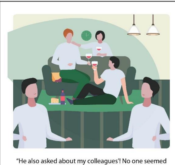
"He also asked about my colleagues'! No one seemed surprised to hear all that."