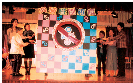
Breaking gender stereotypes to widen horizons!