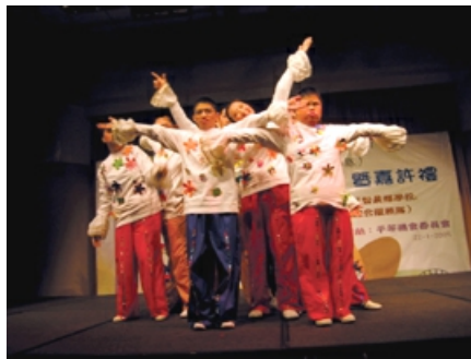
Performing together -children with and without a disability.