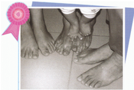
Second Runner-up : Adeline Ko "We Are All Together"