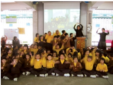
Kids enjoy learning something new - sign language!

Building capacity to foster equal opportunities values since 1997, the EOC has provided funding to over 450 non-governmental organizations, community groups and schools to initiate their own projects to promote the message of equal opportunities. This year the Community Participation Funding Programme has again attracted large groups of participants, and the EOC would like to thank all project organizers for their tremendous efforts!