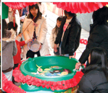
Fun and games - knowing more about developmental disabilities through play.