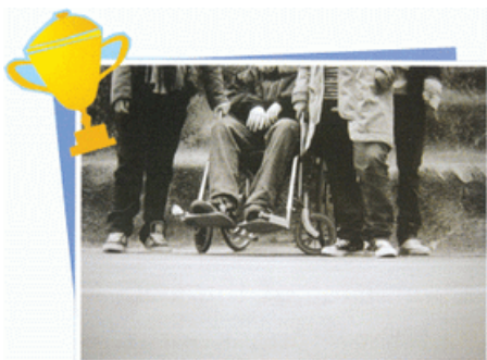
Champion : Wong Chun-sing "Equality Irrespective of Disability"