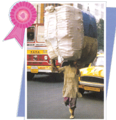
Second Runner-up : Fu Chun-wai "Everyone Can Contribute"