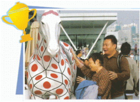
Champion : Cheng Ping-hang "I Can Feel It Too"