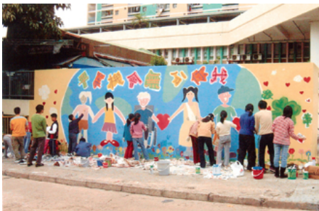
Building a better tomorrow...a new mural depicting "Equal Opportunities for All".