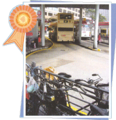
First Runner-up : Au Cheong-chuen "Road to Equal Opportunities"