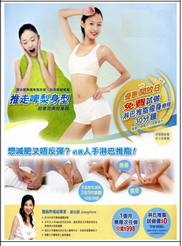
Body Beauty Advertisement