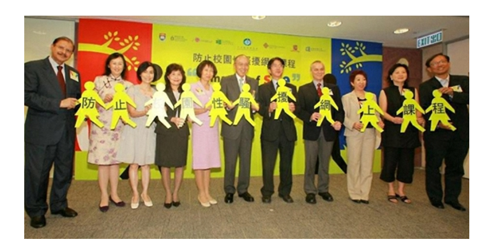
Representatives from eight tertiary institutes together with EOC Members kick off the e-training module.

HK's 1st On-line Training Module on Preventing Sexual Harassment for Tertiary Institutions