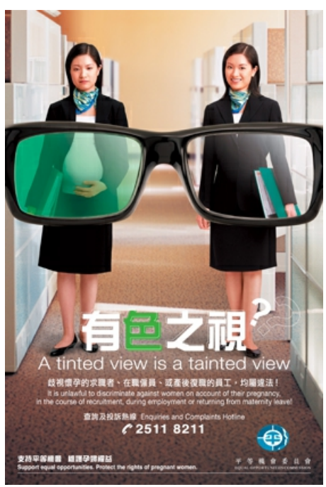
Poster of "Caring Boss"