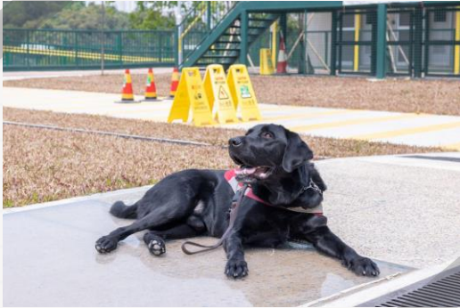
A Good Boy