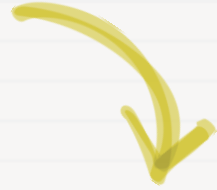
Table of Contents!